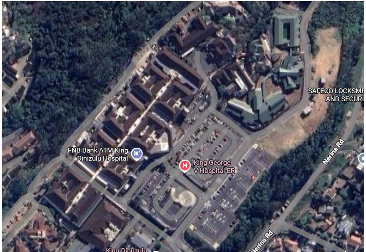
Figure 2: King Dinuzulu Hospital Precinct